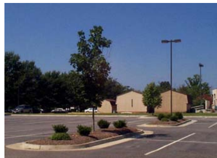
Alternate landscape and light islands within parking areas to prevent trees from growing up into the light fixtures.