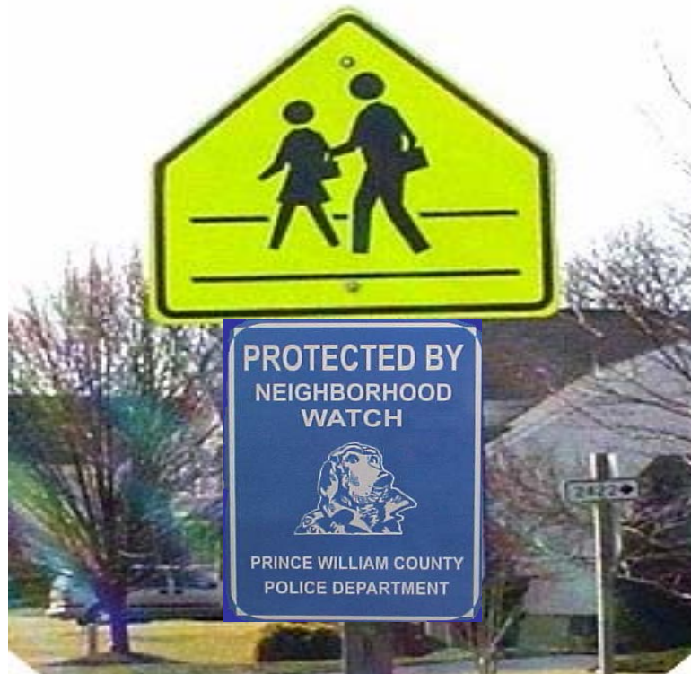
Neighborhoods actively involved in Neighborhood Watch programs take pride in their area and put the would-be criminals on alert.