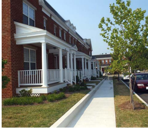
This complex successfully utilizes all of the CPTED concepts.