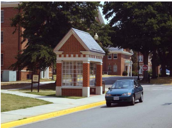
Bus stop shelters provide for safety using CPTED concepts.