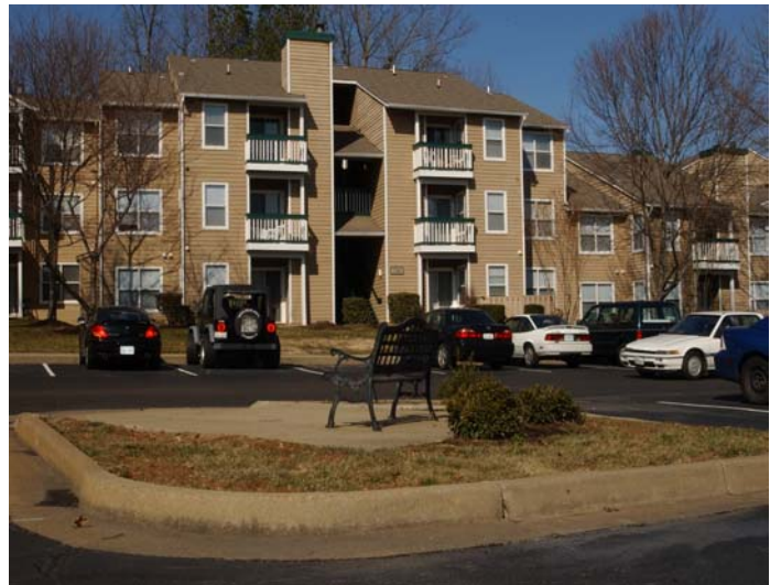
Natural Surveillance provides for more “eyes and ears” in high traffic areas.