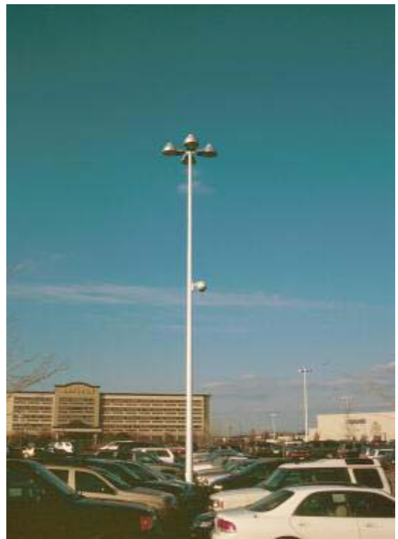
Many malls utilize security cameras in parking areas as well as inside the building.