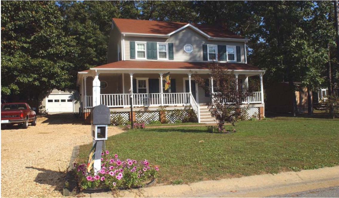
This residence defines ownership of the property, an important CPTED strategy.