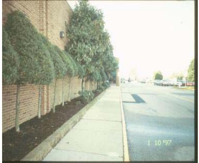
Maintaining landscaping prevents concealment locations.