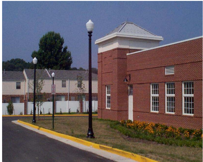
This library is a good example of CPTED with its defined separation from the adjacent apartment complex, its low landscaping, abundance of windows and ample lighting.